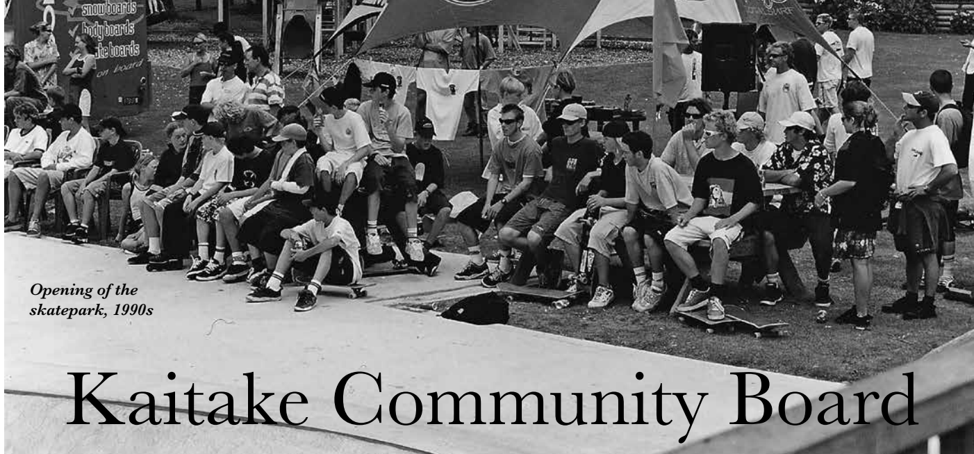
Opening of the skatepark, 1990s